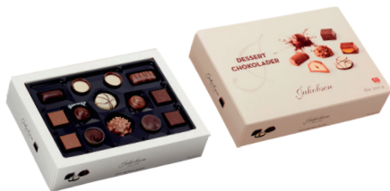
Jakobsen Praline Box 300 g