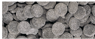
Liquorice Bombs Soft salt liquorice, sugar sprinkled, 2 kg