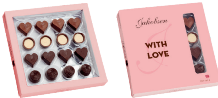
Jakobsen With Love 140 g