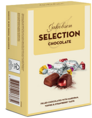
Jakobsen Selection 125 g