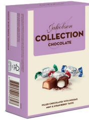
Jakobsen Collection 125 g