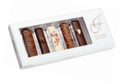
Jakobsen Marzipan Bars Special Edition 200 g