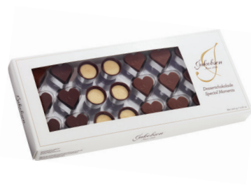
Jakobsen Special Moments 220 g