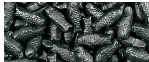
Liquorice Fish Chewy salt liquorice, 2 kg