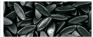
Liquorice Boats Soft sweet liquorice, 2 kg