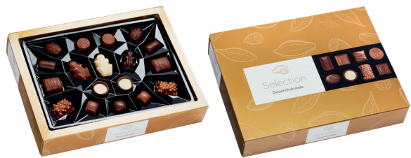
Carletti Selection 350 g