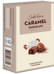
Jakobsen Caramel 125 g