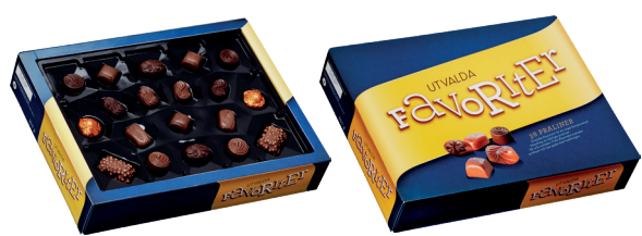
Utvalda Favoriter 350 g