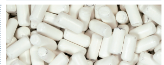
Liquorice Sticks Fondant centres in liquorice and coated with sugar, 2.5 kg