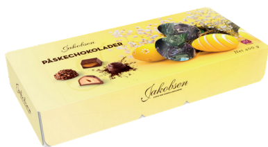
Jakobsen Seasonal Box (Easter) 400 g