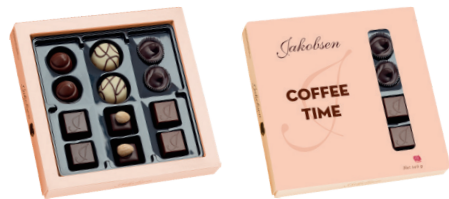
Jakobsen Coffee Time 140 g