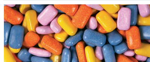
Confetti Sweet liquorice centres coated with sugar, 2.5 kg