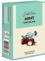
Jakobsen Mint 125 g