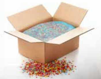
10-15 kg carton