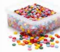
1.2 kg tub