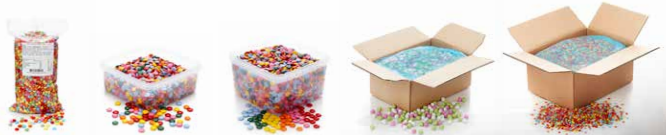
1 kg bag 1.2 kg tub 2.5 kg tub 5 kg carton 10-15 kg carton

The chocolate lentils come in different packages and volumes from bags, boxes/tubs, cartons to Big Bags of 600 kg.