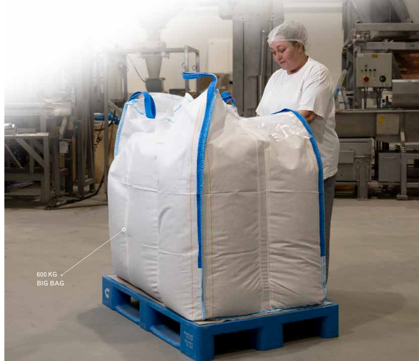
600 KG BIG BAG