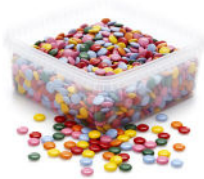
1.2 kg tub