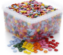
2.5 kg tub