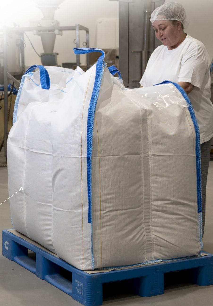
600 KG BIG BAG