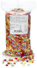
1 kg bag

The chocolate lentils come in different packages and volumes from bags, boxes/tubs, cartons to Big Bags of 600 kg.