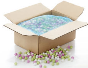
5 kg carton