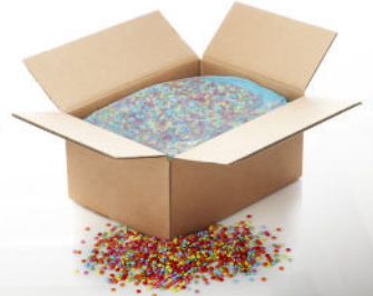
10-15 kg carton