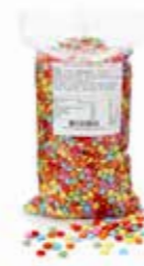
1 kg bag

The chocolate lentils come in different packages and volumes from bags, boxes/tubs, cartons to Big Bags of 600 kg.