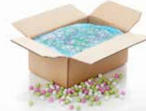
5 kg carton