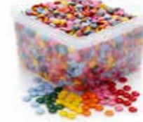
2.5 kg tub