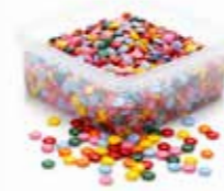
1.2 kg tub